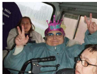
Riding the bus to Walk-A-Mile rally