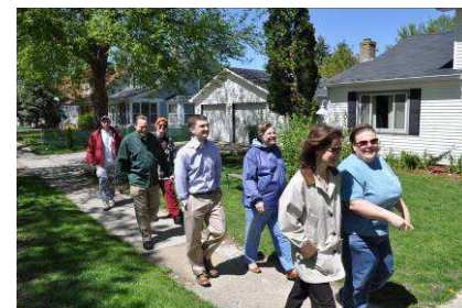
Here are some recent pictures of Genesis House colleagues on the walk.. Come and join us!!!!