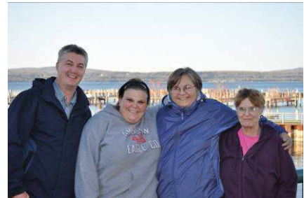
The Genesis House representatives take a break at the waterfront in Petoskey

decisions. I feel they made some good decisions. It went very well.