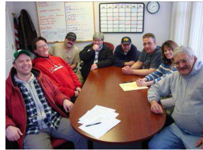
Each unit met to goal plan before the house wide goal planning retreat. Above, the Butterfly Café Unit has a lively discussion about their objectives for the year.

the ongoing Genesis committees—fundraising, public relations, education, employment, & wellness. 12) Increase periodic tracking of progress toward the above goals by creating a system for documenting work completed toward each goal.